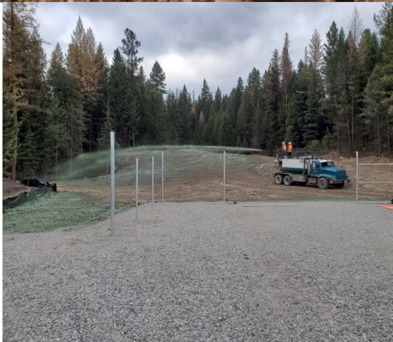
Fortis gas pipeline

Kettle River is looking forward to collaborating with Nupqu to provide combined services to Fortis BC, who are upgrading their distribution system near Elkford, Sparwood, and Cranbrook. After a successful planning stage, Kettle River's Project Team will work onsite with Nupqu for several months under the summer's scope. This is part of a larger multi-year project and strengthen Kettle River's relationship with Fortis BC.