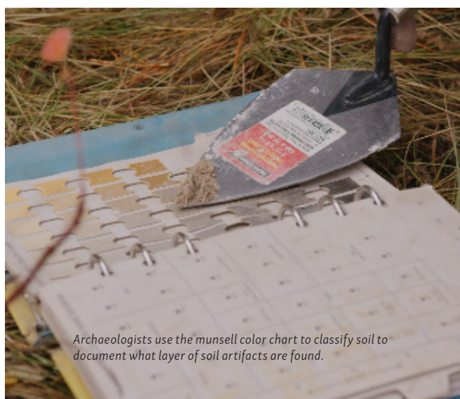
Archaeologists use the munsell color chart to classify soil to document what layer of soil artifacts are found.