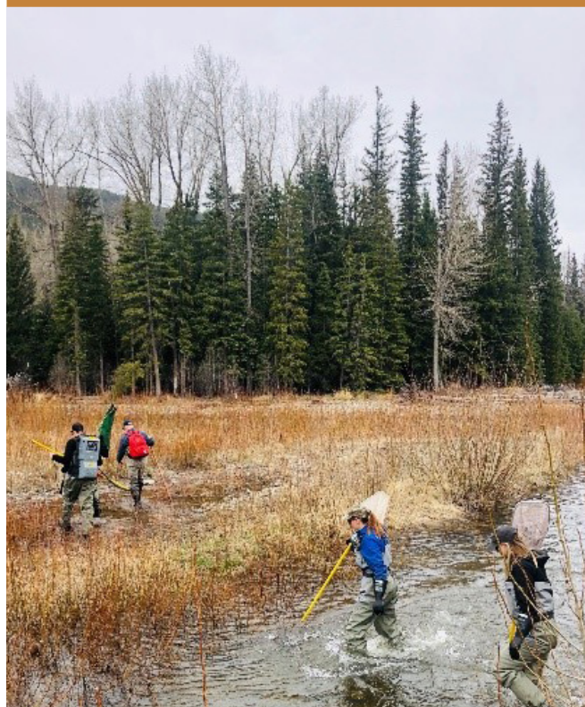
Nupqu Employees capture fish for relocation and invasive plant treatment for Teck Coal's Elk Valley mining operations

p: 250.489.5762 e: ahiggs@nupqu.com nupqu.com